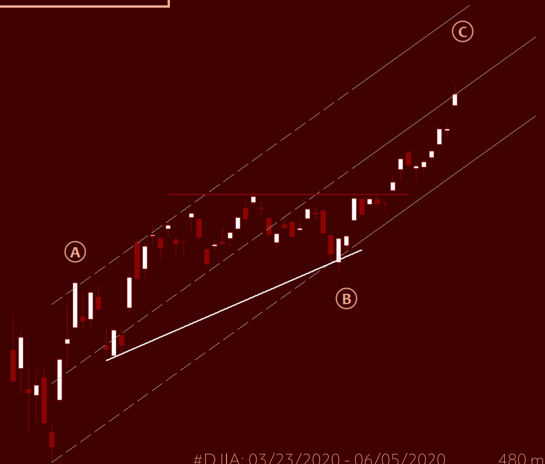
#DJIA: 03/23/2020 - 06/05/2020 480 min chart

Th dow rally leads many to think this is all to good. The jury is out.